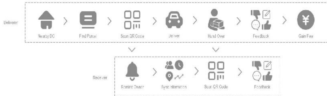
Figure 2 Linker Process